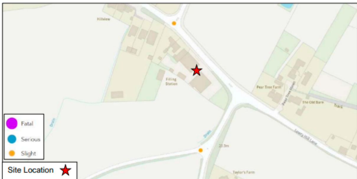
Figure 3.3: MARIO Accident Review

The application is accompanied by a Transport Statement prepared by James Hall and Co. who have provided data from excerpts from LCC's accident information systems. According to this information there have been two 'slight' accidents over the 5 year analysis period both are of a significant distance from the application site. Notably, there have been no accidents recorded over this period outside the premises frontage. Taking into account this evidence, coupled with a new layout and anticipated improved long range visibility then it is considered the development is acceptable from a highway safety standpoint.